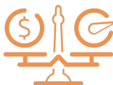
Outside counsel productivity