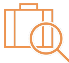
Case strategy decisions